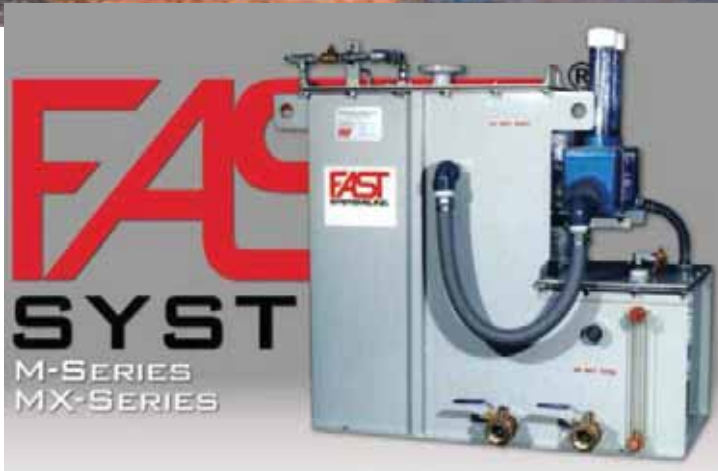
Featured above is an MX-2 Series FAST® Unit.