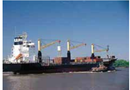
From the very smallest to the very largest vessels, FAST® Systems has a sewage system to meet your vessel's requirements.