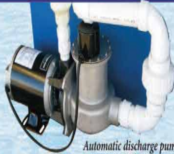
Automatic discharge pump (optional for below-waterline installations)

No Moving Parts No Internal Pump Necessary