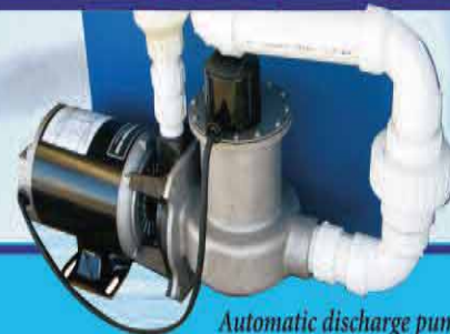
Automatic discharge pump (optional for below-waterline installations)