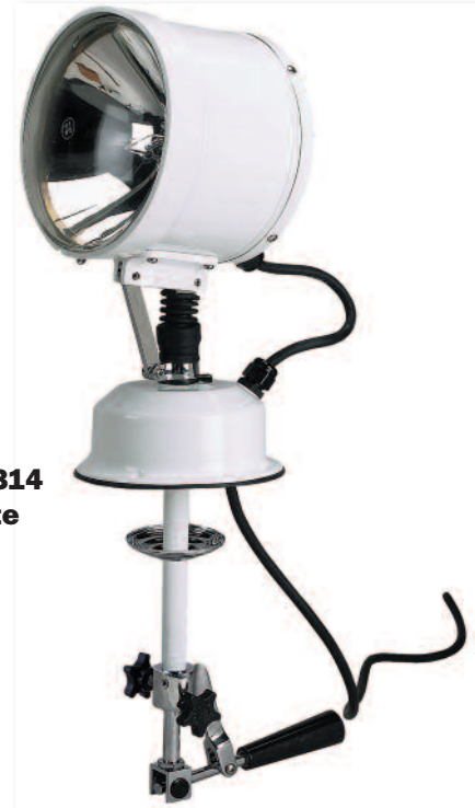
Fig. 0314 White