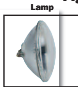
Sealed Beam Included