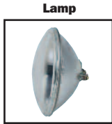
Sealed Beam Included