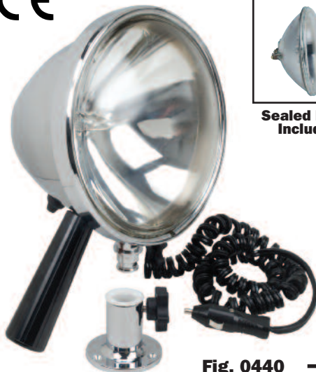
Fig. 0440 No. 3 Shown