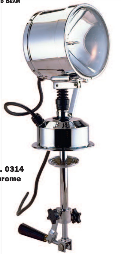
Fig. 0314 Chrome